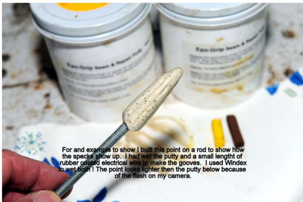
For an example to show I built this point on a rod to show how the specks show up. I had wet the putty and a small length of rubber coated electrical wire to make the gooves. I used Windex to wet both! The point looks lighter then the putty below because of the flash on my camera.