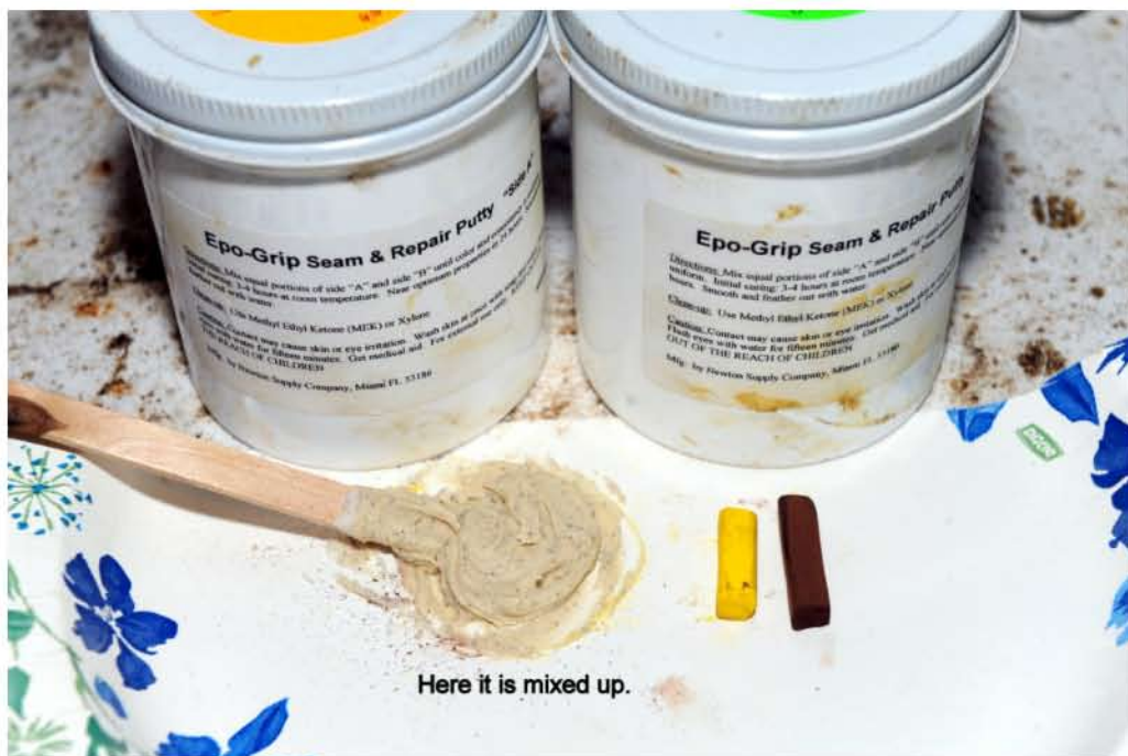
Here it is mixed up.