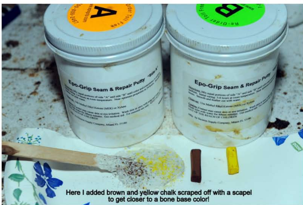
Here I added brown and yellow chalk scraped off with a scapel to get closer to a bone base color!